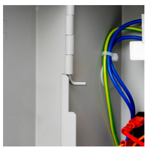
Take out both hinge pins & remove lid

Vision Window cover and hinge pins. Control panels can also be supplied prefitted with the Vision Window on any M2, H2, M3, and H3 size control panels.